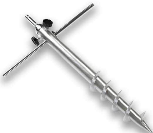
PIEUX FORANT - 1 KG