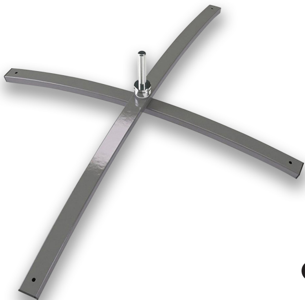
CROISILLON ACIER 1.5 KG