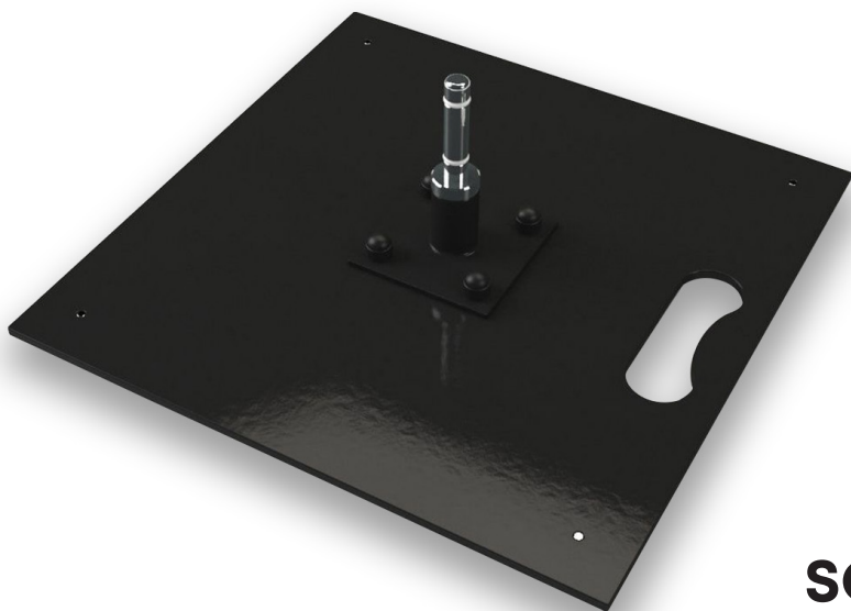
PLAQUE ACIER 10 KG