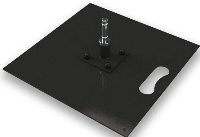
PLAQUE ACIER 5 KG